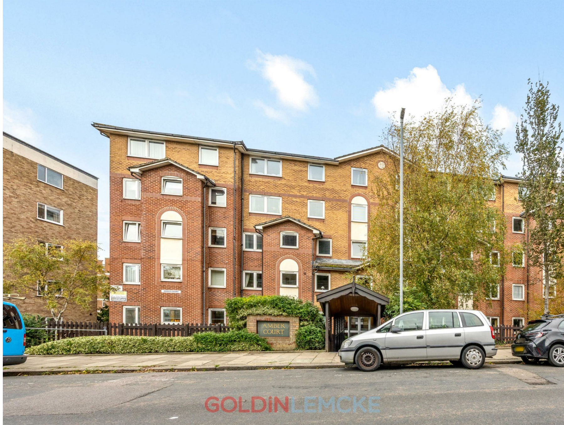
Amber Court, Holland Road, Hove, BN3 1LU £180,000